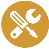
Fashion and Trend Creators