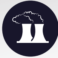
Industrialist & Factory Owners