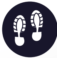
Shoes Component Manufacturers