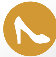
Design Houses Fashion Designers