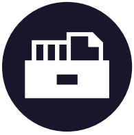
Trade Associations & Federations