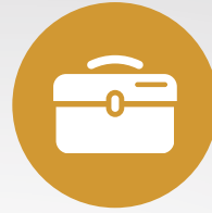
Trade Delegations & Foreign Missions