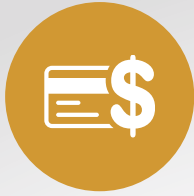
Investors & Businessmen