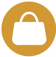
Bags and Leather Manufacturers