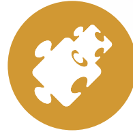
Wholesalers & Distributors