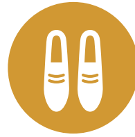
Footwear & Leather Specialist