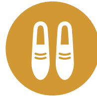
Footwear & Leather Specialist