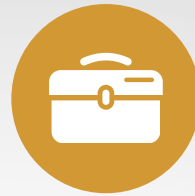
Trade Delegations & Foreign Missions