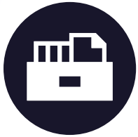
Trade Associations & Federations